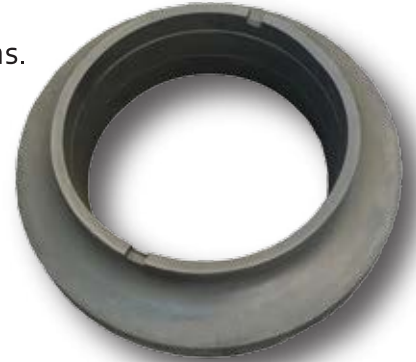
Hutchinson VFI Runflat