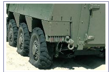
The beadlock function of VFI Runflat allows mobility during low pressure operation.